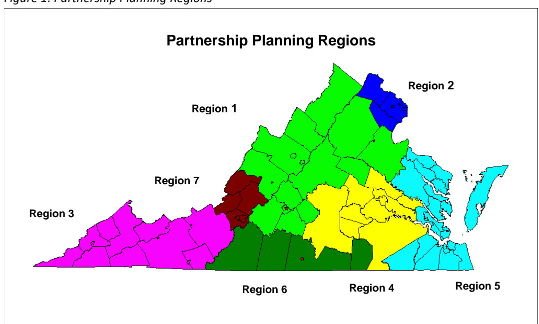
Figure 1: Partnership Planning Regions

There are five health planning regions (<u>HPR</u>) across the Commonwealth's service system, divided into seven partnership planning regions (<u>PPR</u>). The PPRs are similar to the HPRs with a few exceptions. PPRs are generally linked with an area served by a state facility, such as Western State Hospital, which predominantly serves PPR 1 and Northern Virginia Mental Health Institute, which serves PPR 2. These partnerships provide environments for addressing regional challenges and service needs and collaboratively plan and implement regional initiatives. Partnership participants include representatives from the CSBs, state facilities, community inpatient psychiatric hospitals, private providers, individuals receiving services, family members, advocates, and other stakeholders.